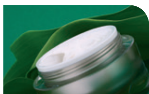
Cosmetics ECOCERT Greenlife and COSMOS

They encourage the use of natural or from natural origin raw materials and guarantee the use of environmentally friendly processes all over the production line. They have been developed in collaboration with experts and actors in the industry, taking into account the specificities of each sector.